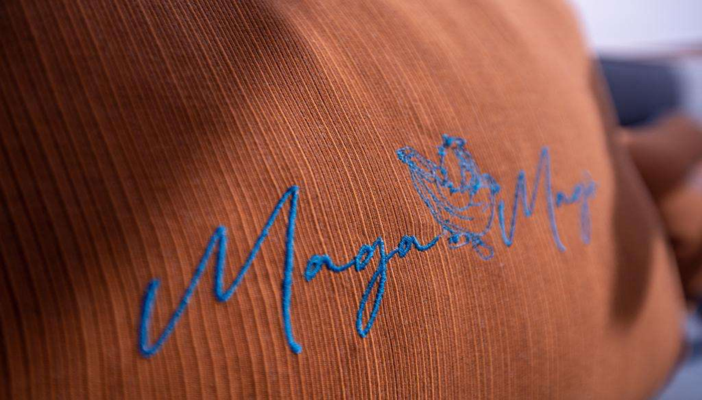
"MAGA MAGO" Details