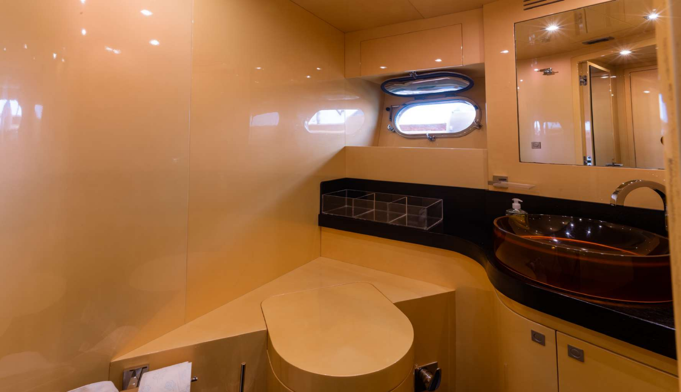
"MAGA MAGO" Bathroom