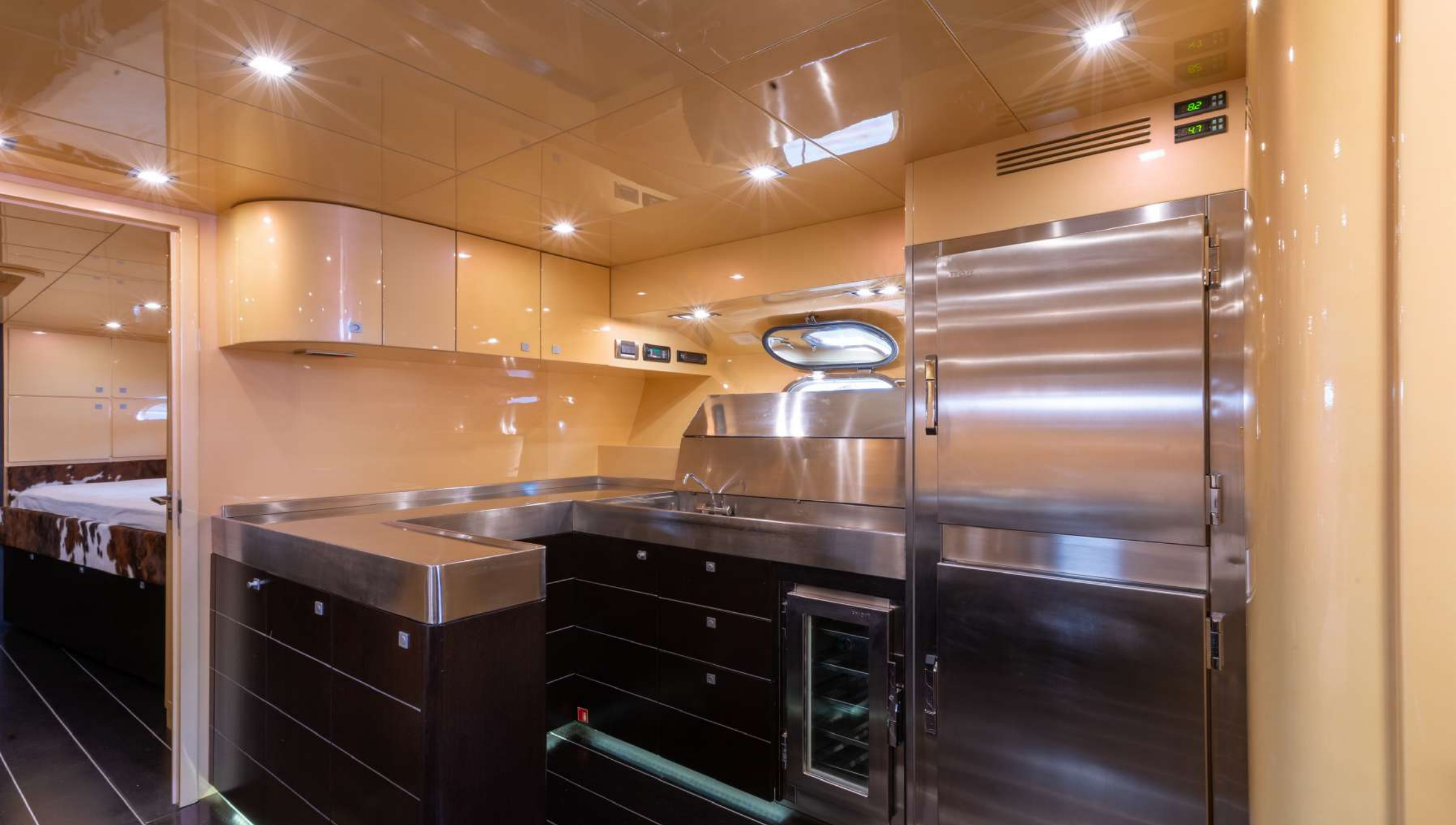
"MAGA MAGO" Kitchen