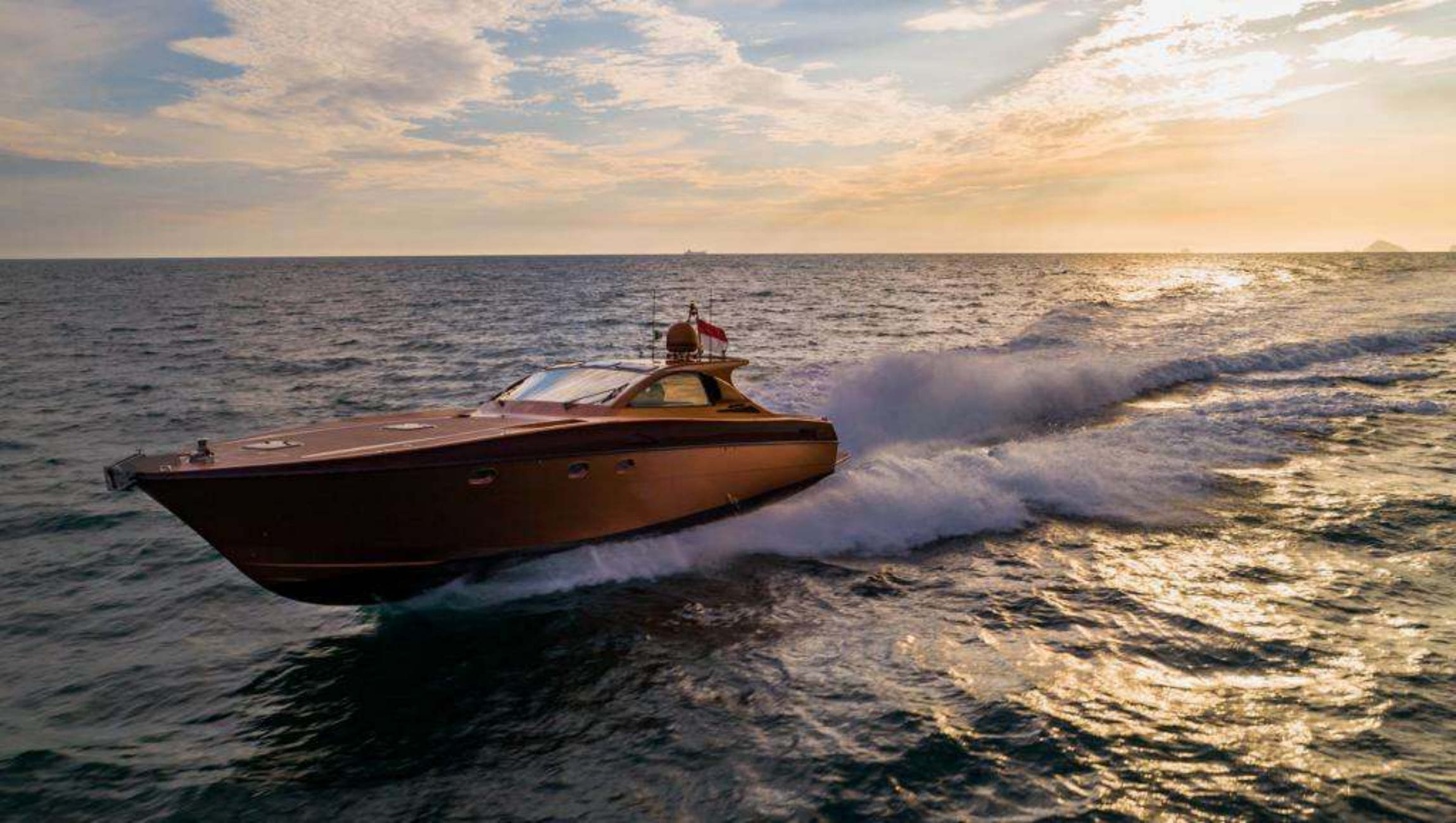
"MAGA MAGO" Underway