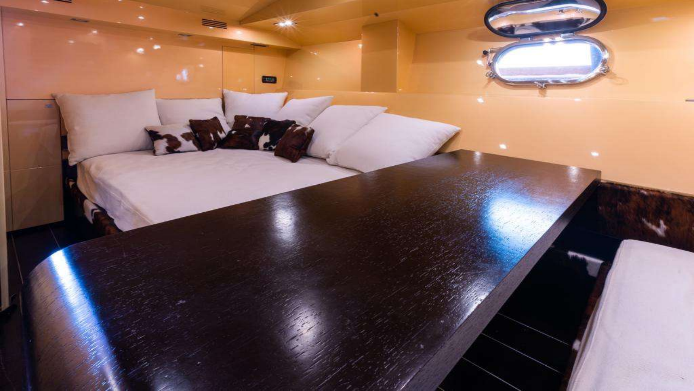
"MAGA MAGO" Owner's Cabin