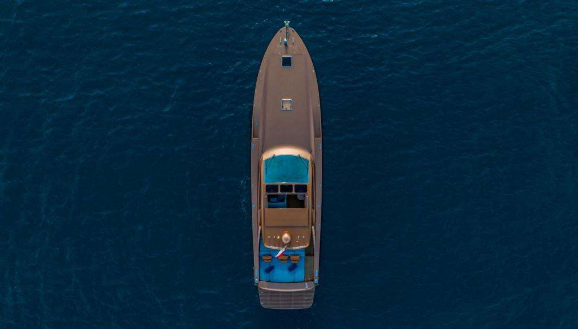
"MAGA MAGO" Underway