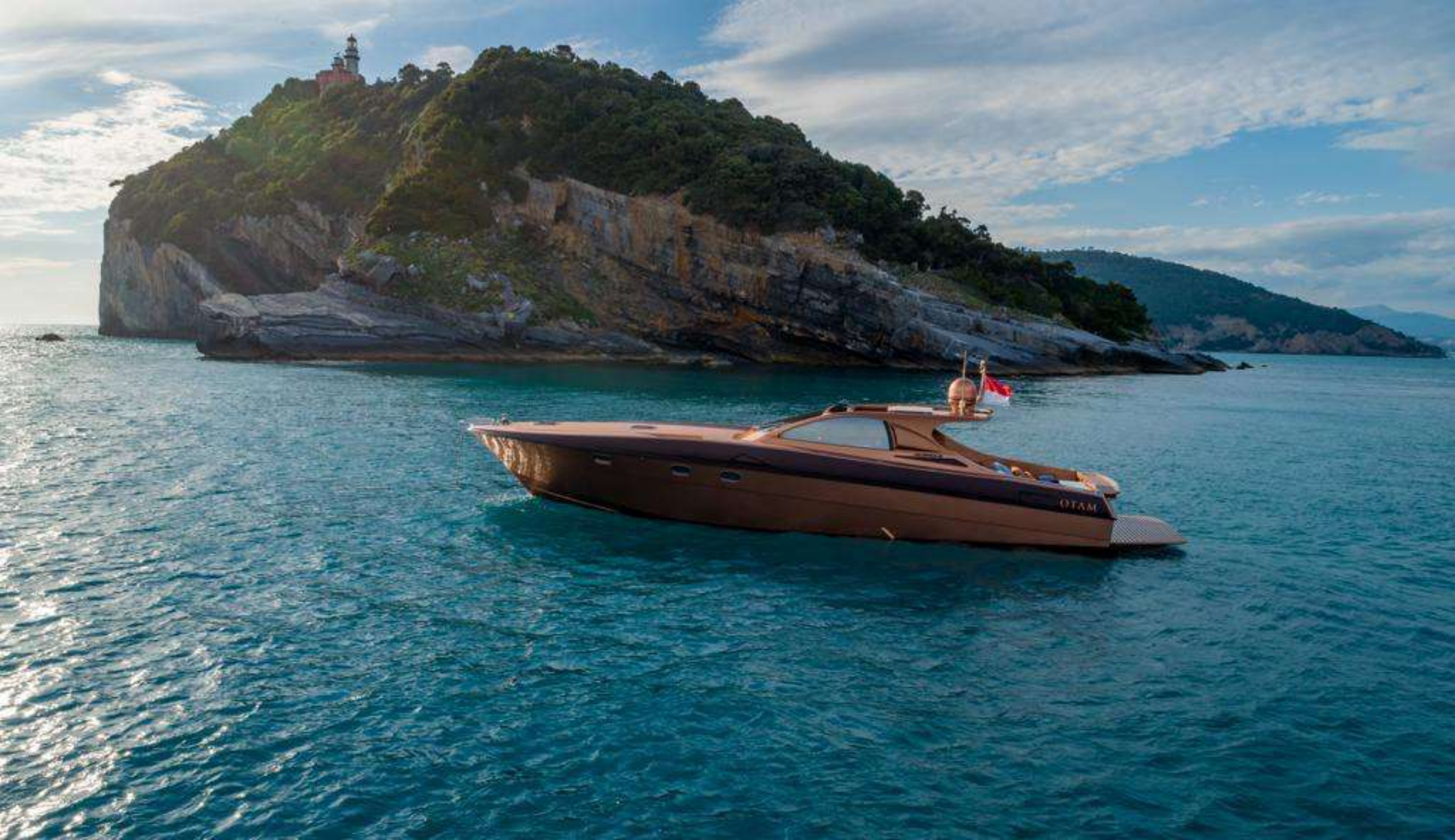
"MAGA MAGO" Profile