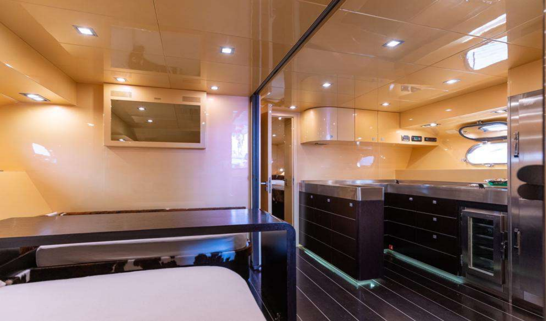
"MAGA MAGO" Details Owner's Cabin