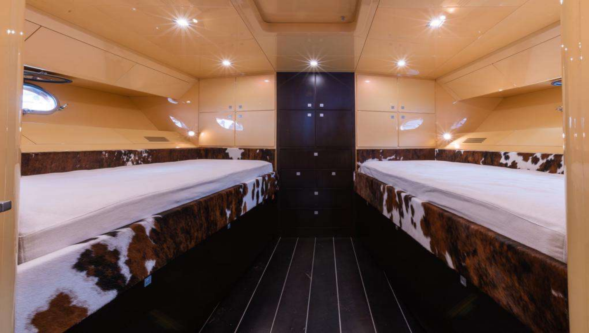
"MAGA MAGO" Guest Cabin